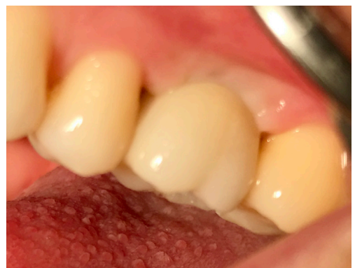
5. Loading at 12 weeks