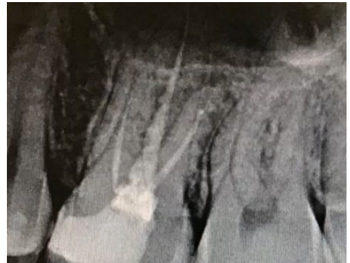
1. Initial situation - issue with previous root canal treatment

Case from Dr Andrew Fish, Jersey Channel Islands