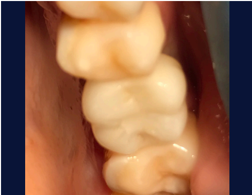
6. 6 months loaded