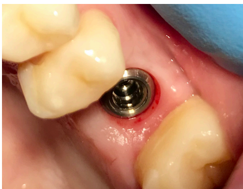
4. Loading at 12 weeks