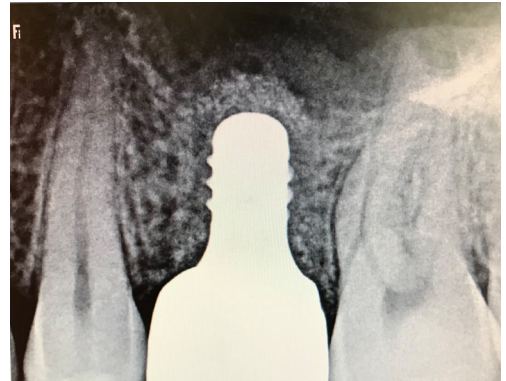
7. 6 months loaded