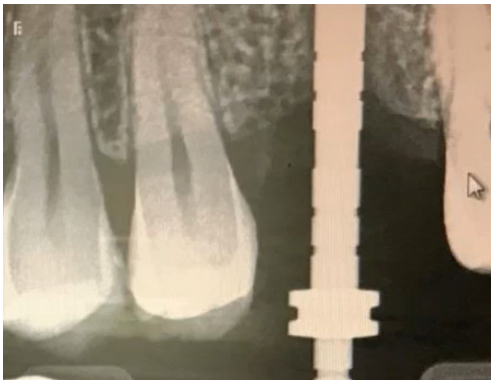
2. 3 months following extraction