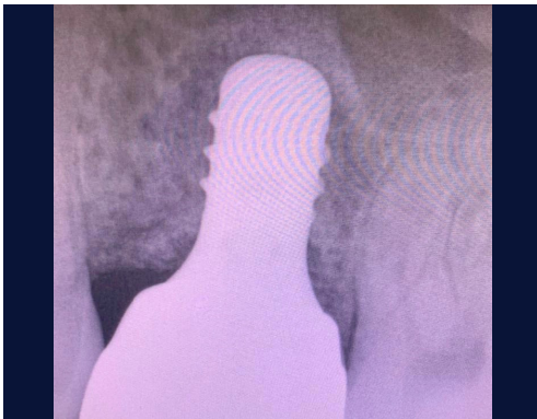
8. 3 years loaded